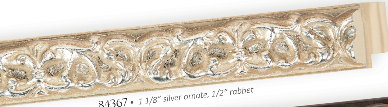
84367 • 1 1/8" silver ornate, 1/2" rabbet