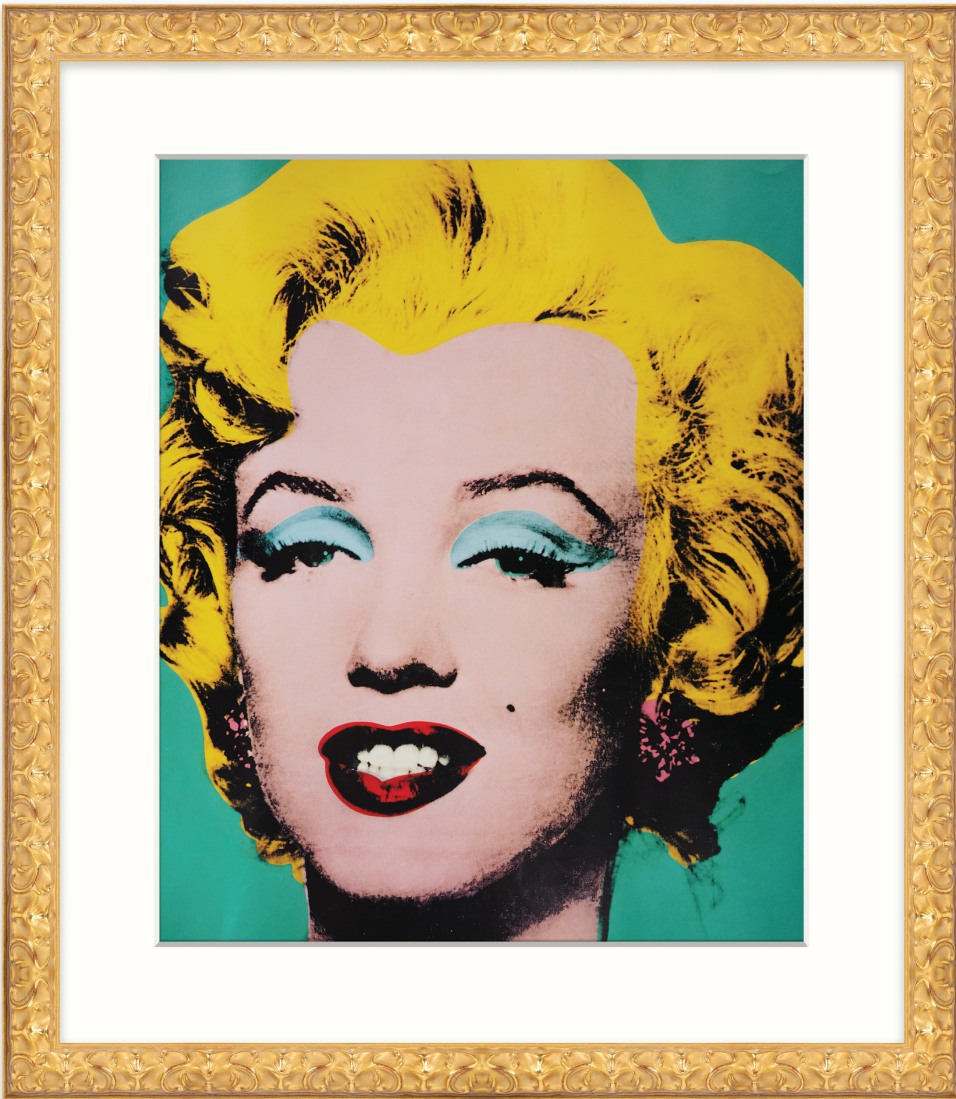
△ Art (above): Marilyn Monroe 1962