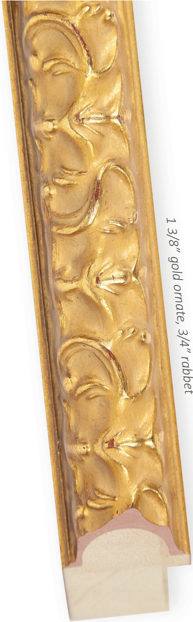
1 3/8" gold ornate, 3/4" rabbet