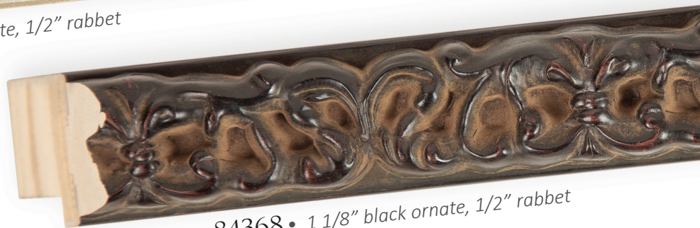
84368 • 1 1/8" black ornate, 1/2" rabbet