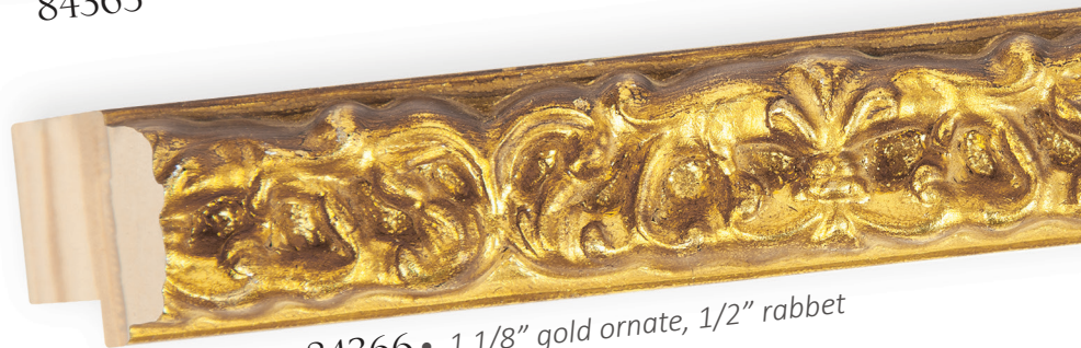
84366 • 1 1/8" gold ornate, 1/2" rabbet