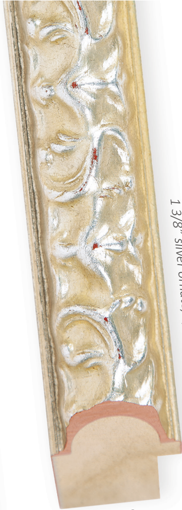
1 3/8" silver ornate, 3/4" rabbet