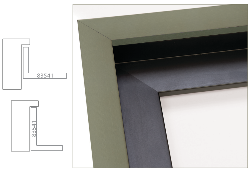
Shown: Apex 83703 paired with floater 83541

Apex Collection mouldings make ideal FloatMates. Paired with Omega Floater 83541 (1" depth, or 1 3/8" depth turned 90°), Apex mouldings can be used to create attractive floater frames. Adding the height of the lip, float depths increase to 1 1/4" to 1 5/8" respectively.