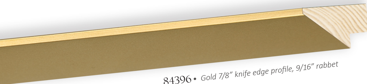
84396 • Gold 7/8" knife edge profile, 9/16" rabbet