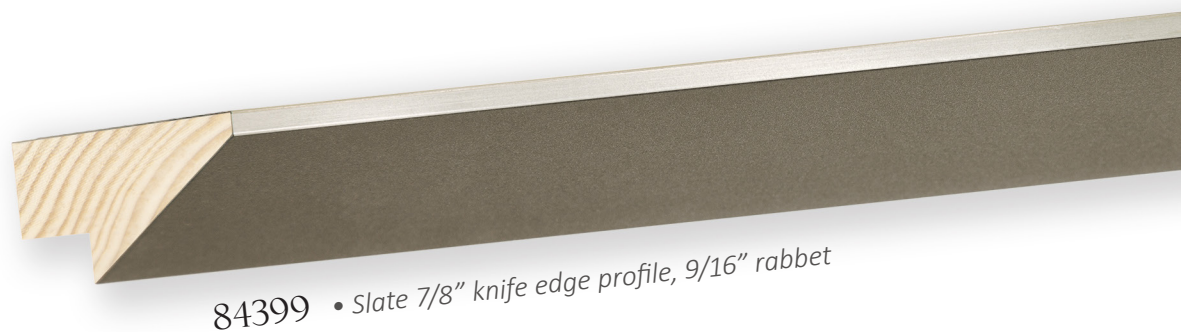
84399 • Slate 7/8" knife edge profile, 9/16" rabbet