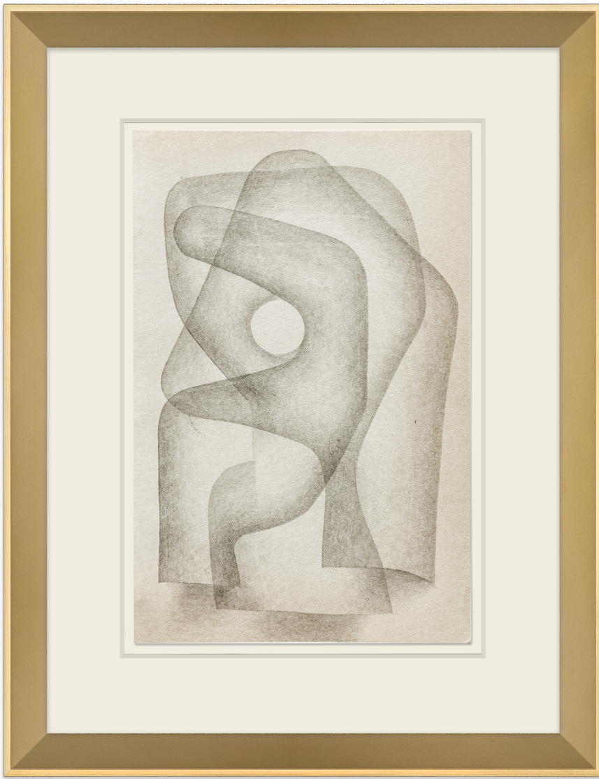
△ Art (above): Emergent , Tim Biskup c.2020