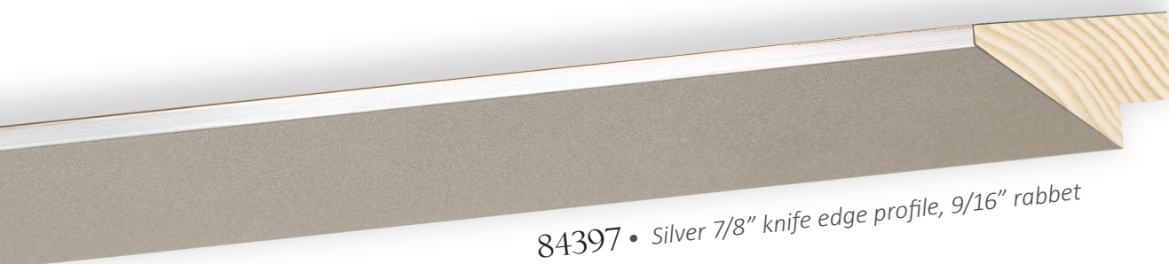
84397 • Silver 7/8" knife edge profile, 9/16" rabbet