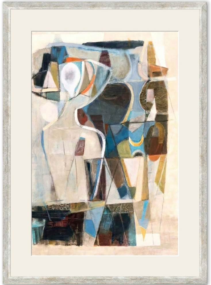
Digital print, painting (right) Abstrakte Komposition , Linda Söber c.1953 >

The collection features two versatile profile widths of 3/4" and 1 1/8" to suit both delicate works on paper and larger scaled pieces.