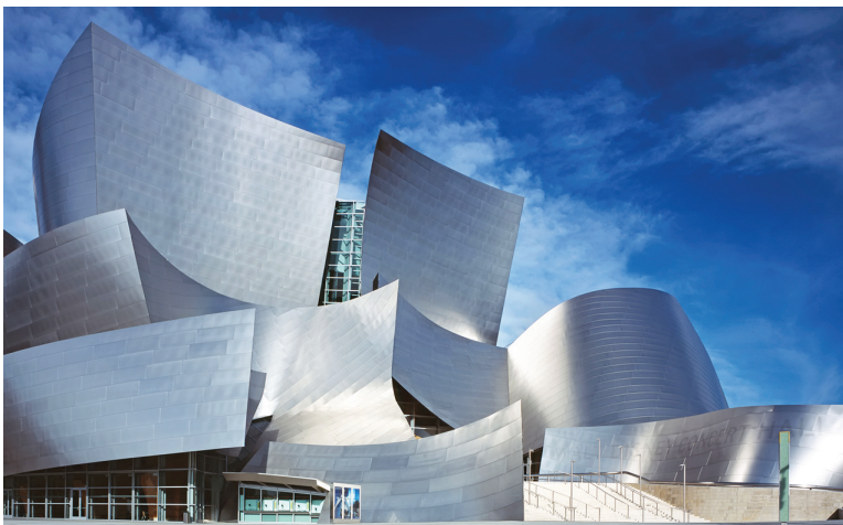
Walt Disney Concert Hall · Los Angeles, California