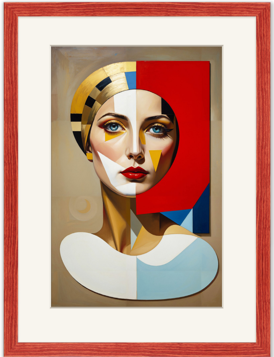
△ Digital print, collage (above) Eclipsed Self , Sephora Venites c.2018

Whether framing modern genres such as decorative prints and photography, to more traditional pieces such as watercolors, etchings, and treasured heirlooms, the collection's attributes play well with a balance of subtlety and richness. Additionally, the 5/8" square profile provides framers with a great solution to use its scale for combining and stacking with other mouldings, or to use in creating colorful table frames.