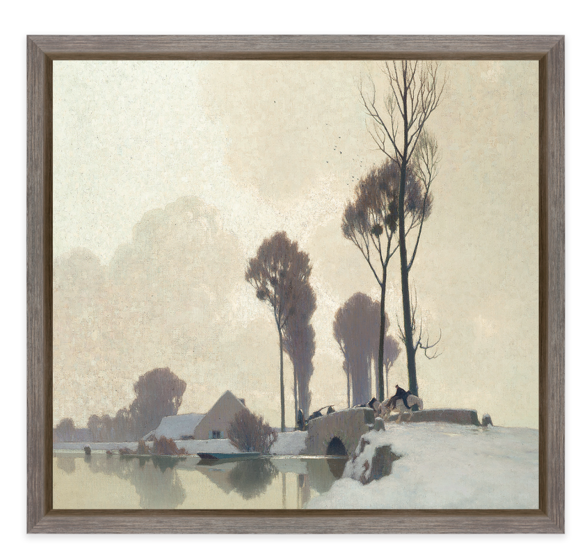
△ Above: 84120, 1 3/8" floater Crossing A Bridge In Snow by Alexandre-Louis Jacob (1921)