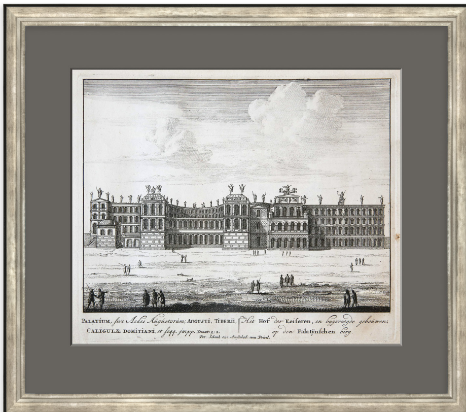
84334: Silver w/black back edge 1 3/8" height x 1 1/2" wide profile