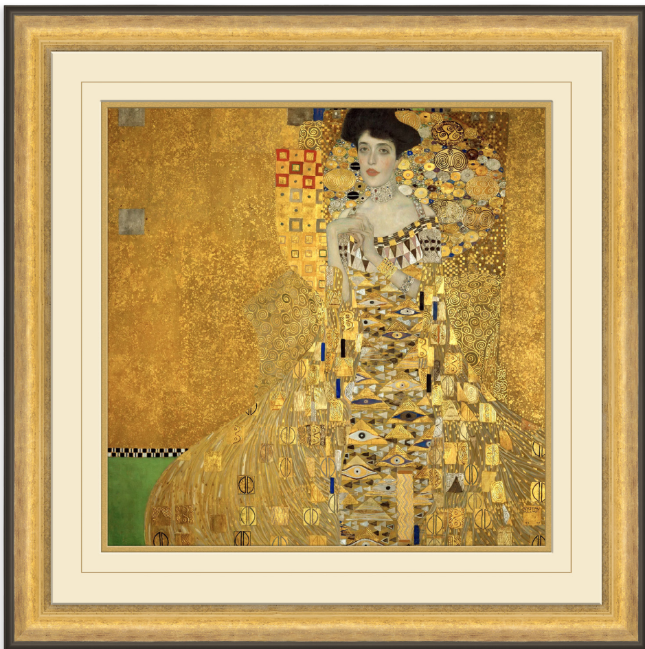
△ (Above): Portrait of Adele Bloch-Bauer I Gustav Klimt, c.1907 84331: Gold w/black back edge 1 3/4" height x 2 1/2" wide profile

This collection is excellent for framing classic genres as well as contemporary pieces due to its simple lines and elegant profiles.