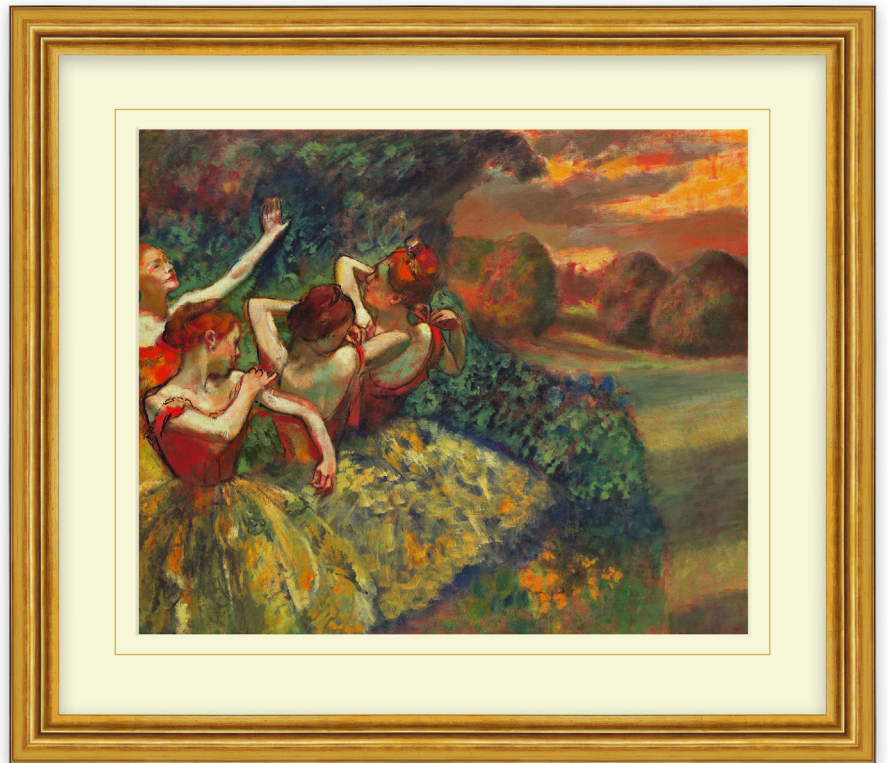
△ Art (above): Four Dancers , Edgar Degas c.1899

Parker is a great companion to Carlyle and York collection mouldings. Gold, silver, black and plum selections from each can be used together in a series, on the same wall, or combined in a single design.