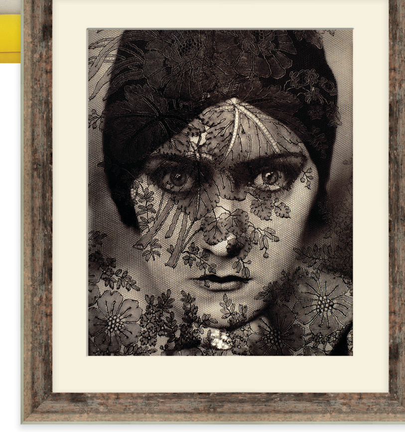
△ Above: 84053, pewter/bisque (2 3/4") Portrait of Gloria Swanson, by Edward Steichen

Theo is a transitional collection with an inherently vintage feel. It is an excellent choice for framing etchings, black and white photography, lithography, art deco era prints, and industrial urban themed artwork. The larger items of the collection are exquisite for framing mirrors (84051-53, 2 3/4").